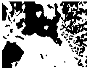
Figure 1 - actual image

How can one however presume to fault Dixon's conclusions shared, as Packer rightly indicates, by majority Western Christians throughout church history (though not by Eastern Orthodoxy 17 )?